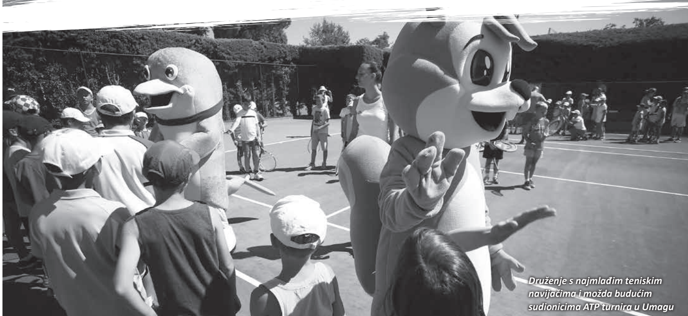
Druženje s najmlađim teniskim navijačima i možda budućim sudionicima ATP turnira u Umagu