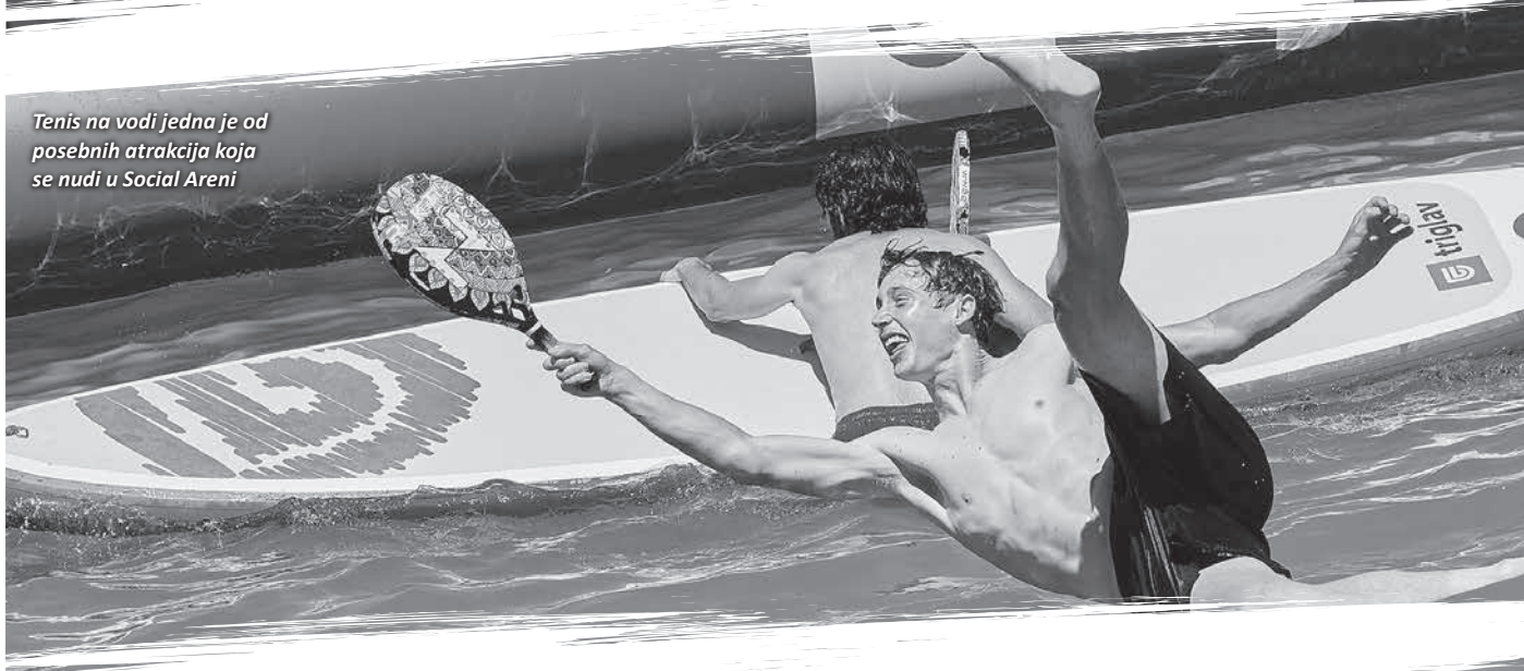
Tenis na vodi jedna je od posebnih atrakcija koja se nudi u Social Areni